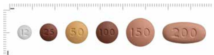
The tablets are shown in their actual size